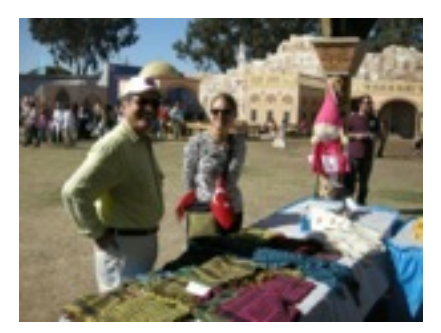
Los Angeles, Fair